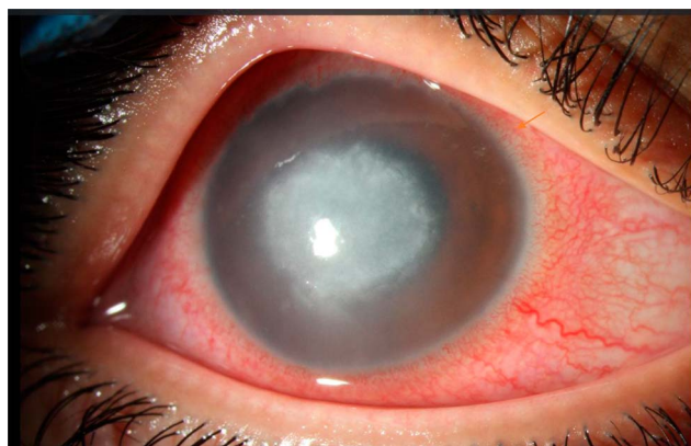
FIG. 2. (Rebecca Rojas, OD). Slitlamp photograph showing Acanthamoeba keratitis related to decorative contact lens use.